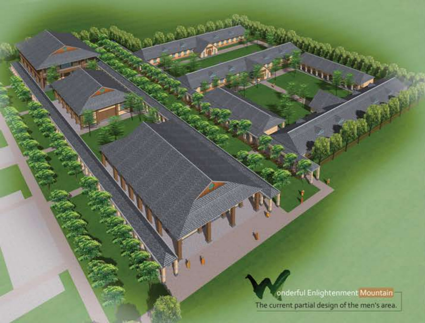
Wonderful Enlightenment Mountain The current partial design of the men's area.

Following the Venerable Master's vision, Dharma Realm Buddhist Association will found on the eastern portion of the City of Ten Thousand Buddhas the International Institute of Philosophy and Ethics (IIPE) as a beacon of wisdom and compassion for all living beings of the Dharma Realm.