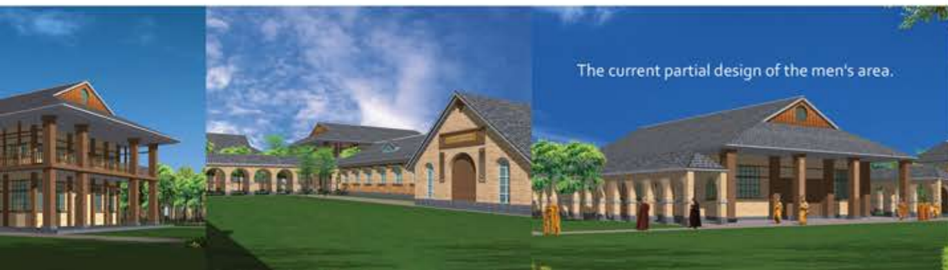
The current partial design of the men's area.

Following the Venerable Master's vision, Dharma Realm Buddhist Association will found on the eastern portion of the City of Ten Thousand Buddhas the International Institute of Philosophy and Ethics (IIPE) as a beacon of wisdom and compassion for all living beings of the Dharma Realm.