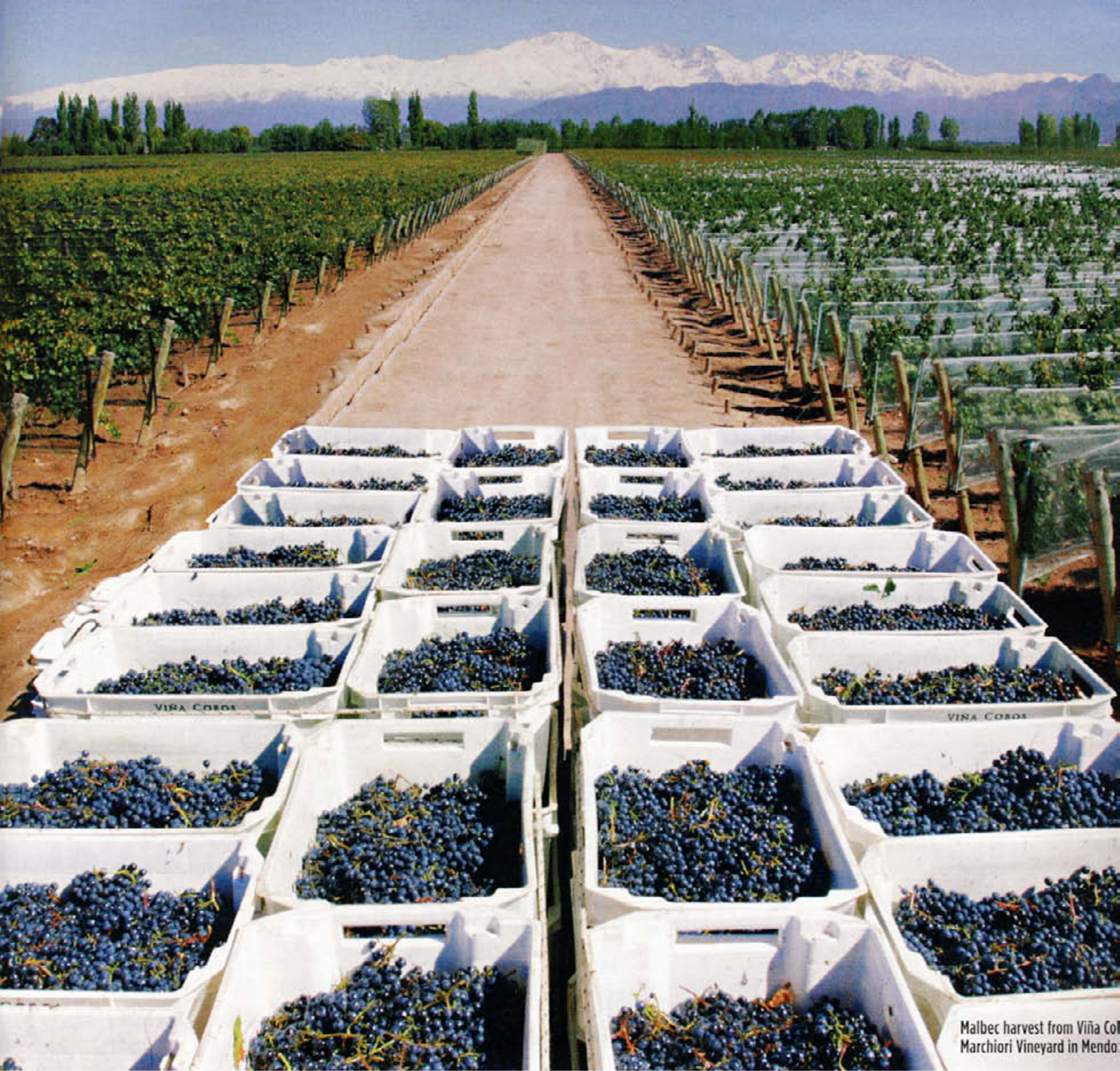
Malbec harvest from Viña Col Marchiori Vineyard in Mendoza