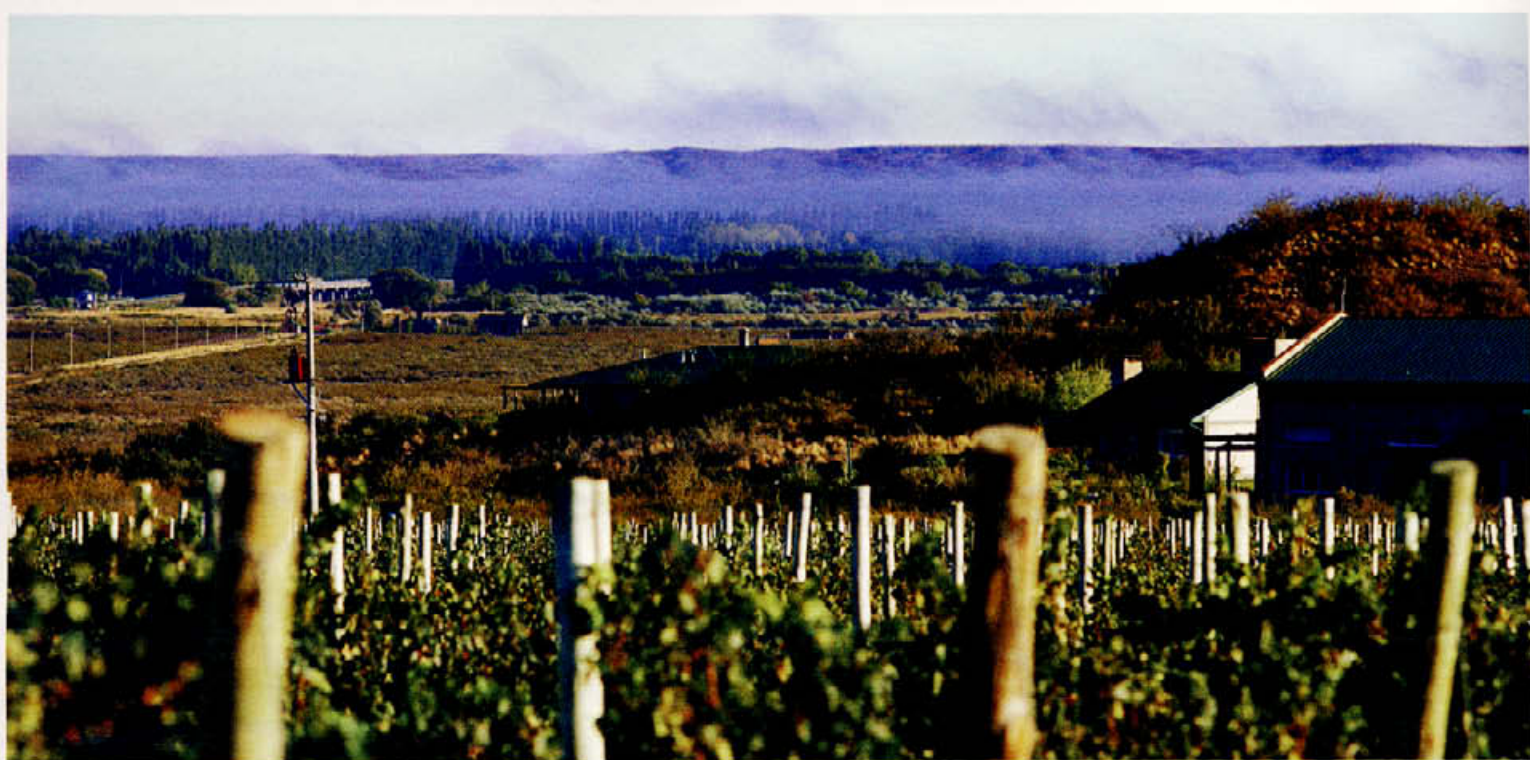
Mist drifts off the river in Patagonia's Valle de Azul, where Bodega Noemía de Patagonia makes gorgeous Malbecs, such as its top-rated Río Negro Valley bottling, at a newly built winery.

denser, with loads of plum and blackberry fruit. The Malbec Mendoza Argentino 2005 (95, $123) blends grapes from Gualtallary and Altamira to create a muscular, toast- and fruit-filled version.